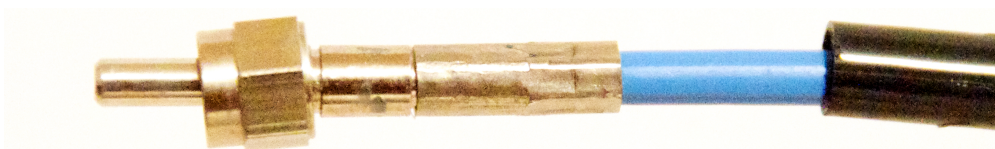
SMA termination with boot removed