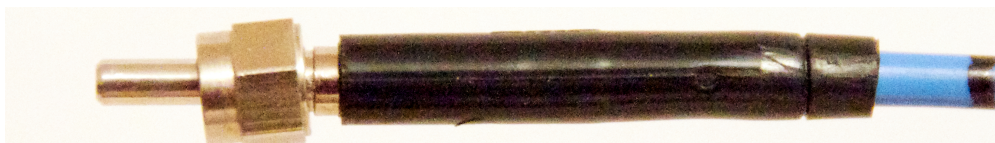
SMA termination with boot

The most likely entry point for water is where the cable's outer jacket enters the fiber optic connector. This is normally covered by a strain-relief "boot" as shown below. This boot may or may not form a seal by itself.